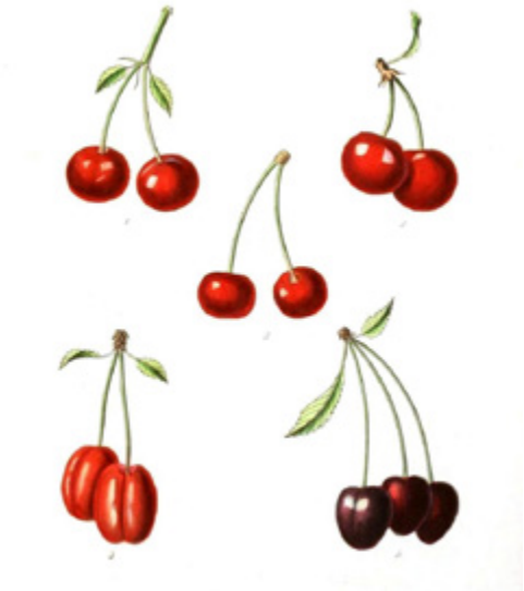
Illustration of Botanical Research Anonymous European artist