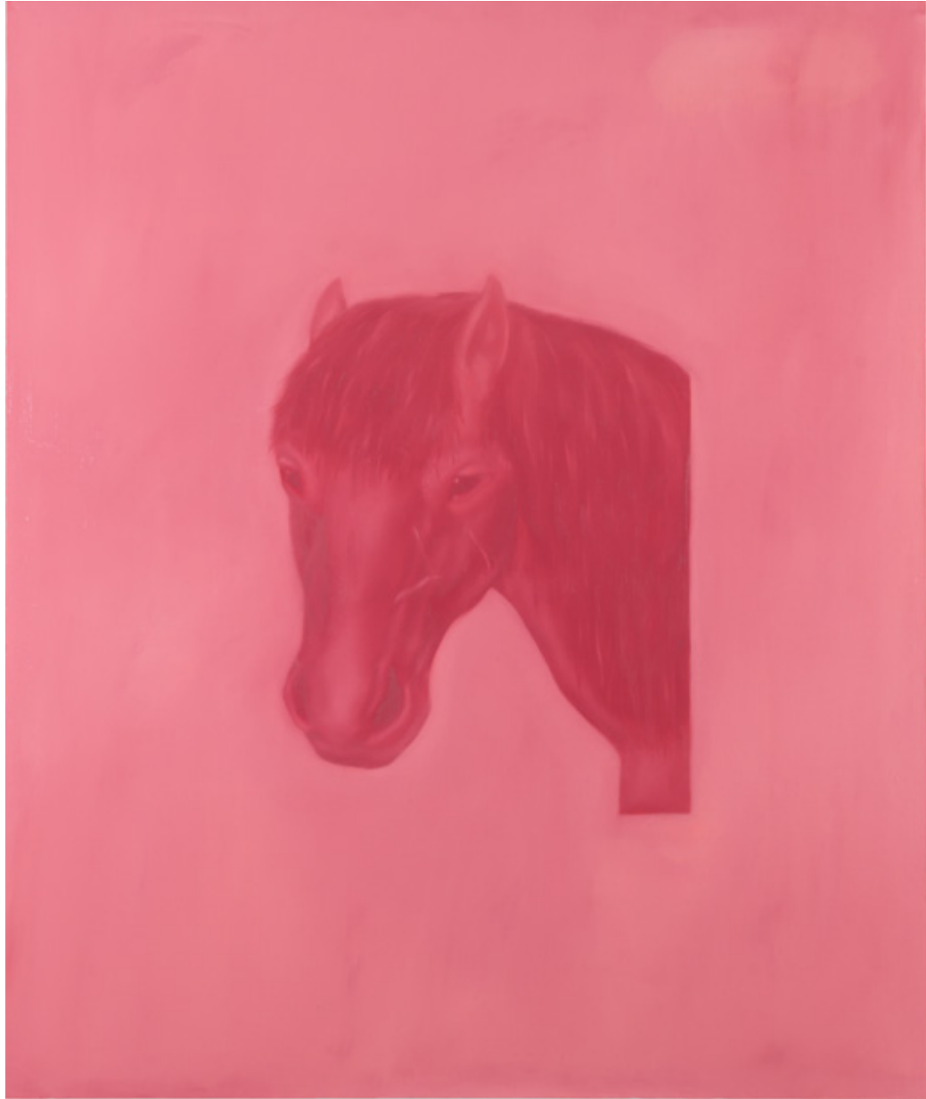
Horse (After Lang Shining aka Giuseppe Castiglione) 2018 Oil on Linen 60h x 48w in (154.4h x 121.1w cm)