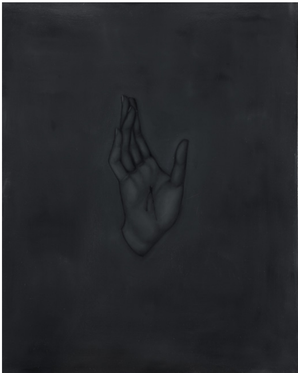
Stigmata (After Hans Memling) 2018 Oil on Linen 60h x 48w in (154.4h x 121.1w cm)