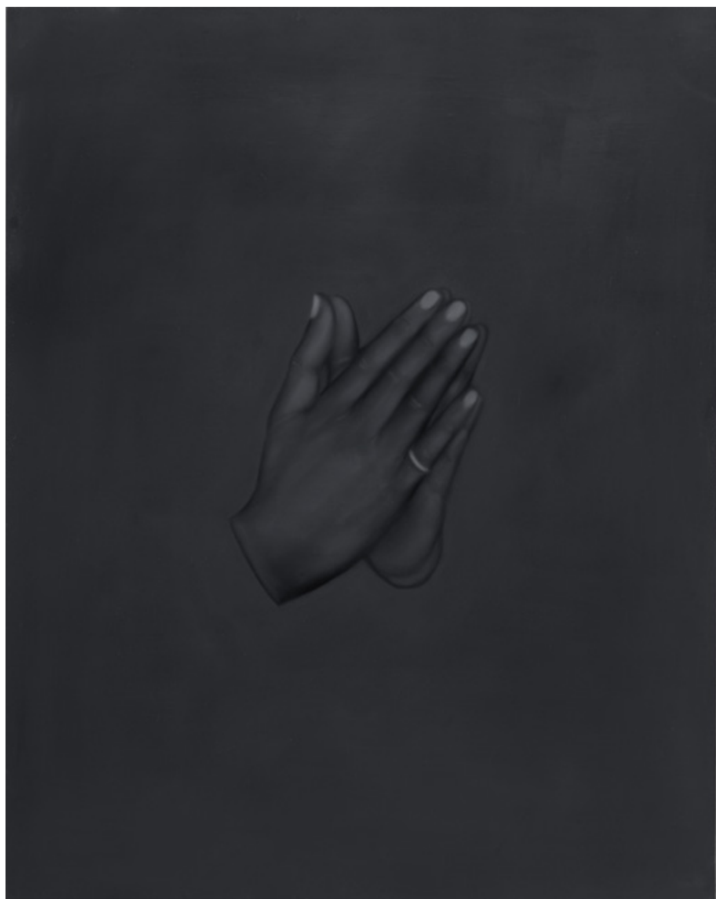
Praying Hands (After Hans Memling) 2018 Oil on Linen 60h x 48w in (154.4h x 121.1w cm)