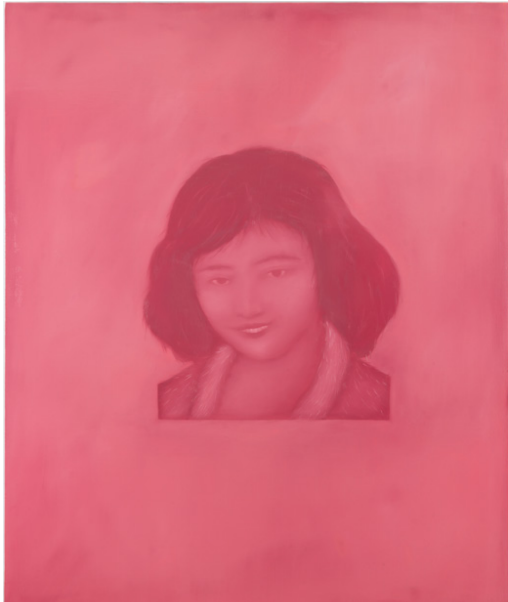
Young Woman (After 1930s Chinese Insect Repellent Poster) 2018 Oil on Linen 60h x 48w in (154.4h x 121.1w cm)