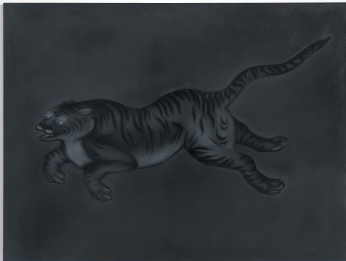
Flying Tiger (After Kano Tanyu) 2018 Oil on Linen 54h x 72w in (137.2h x 182.9w cm)