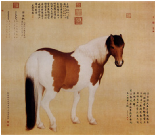
Illustration of a horse Lang Shining (Giuseppe Castiglione)