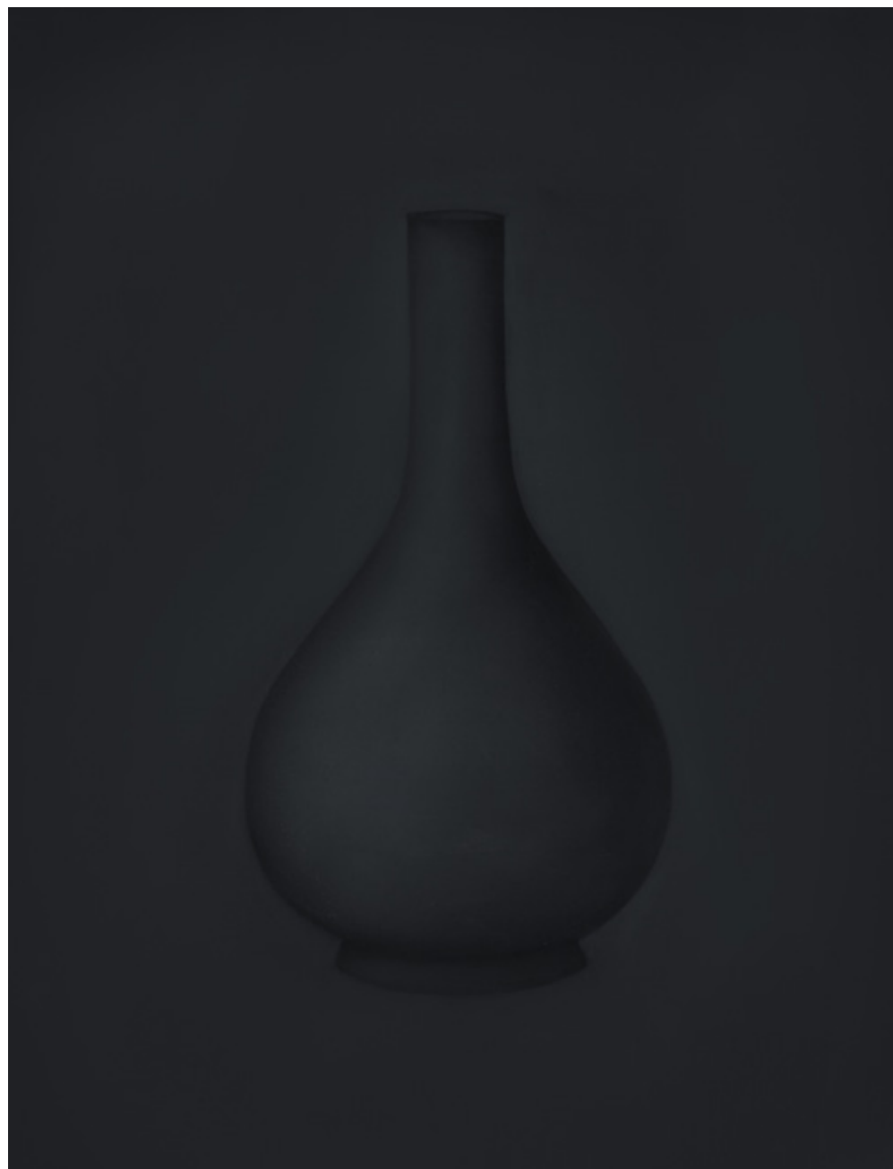
Vase (After Ming Dynasty Vessel) 2018 Oil on Linen 60h x 48w in (154.4h x 121.1w cm)