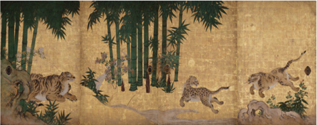
Tigers in a Bamboo Grove (Tigers at Play), Kano Tanyu, mid-1630s