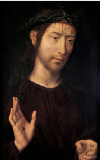
The Man of Sorrows Blessing Hans Memling 1480 - 1490