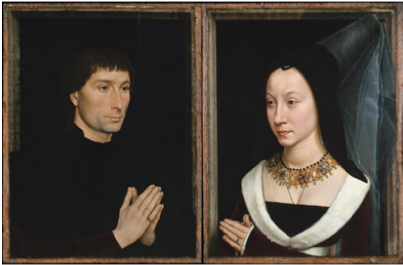
Tommaso di Folco Portinari (1428–1501); Maria Portinari (Maria Maddalena Baroncelli, born 1456) Hans Memling ca. 1470