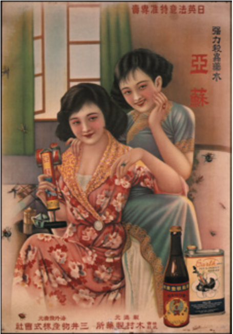
1930's Chinese Insect Repellent Poster