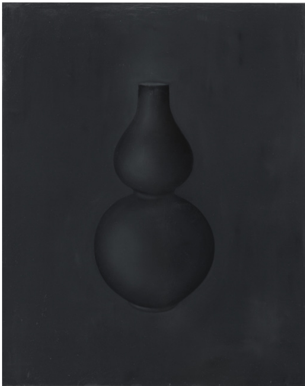
Vase (After Yuan Dynasty Double-Gourd) 2018 Oil on Linen 60h x 48w in (154.4h x 121.1w cm)