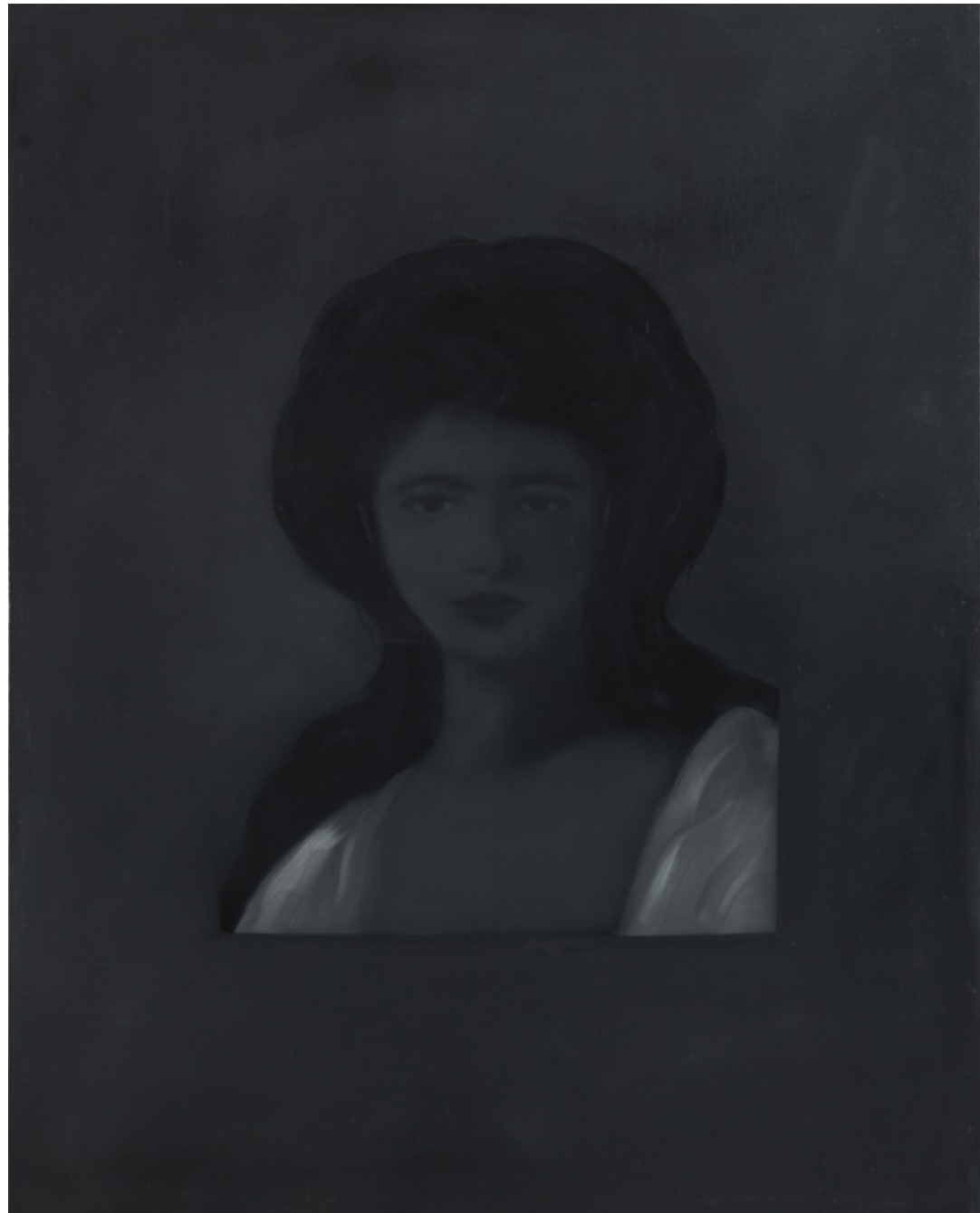
Young Woman (After George Romney) 2018 Oil on Linen 60h x 48w in (154.4h x 121.1w cm)