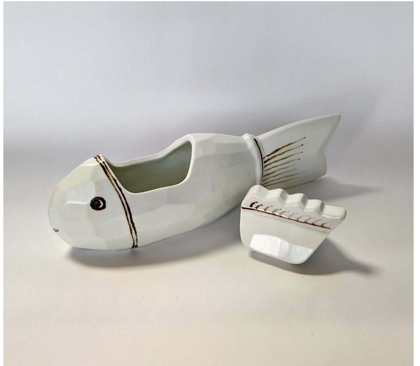
Kim Yikyung, Mini Carp (Plain White) , (2023), YK172