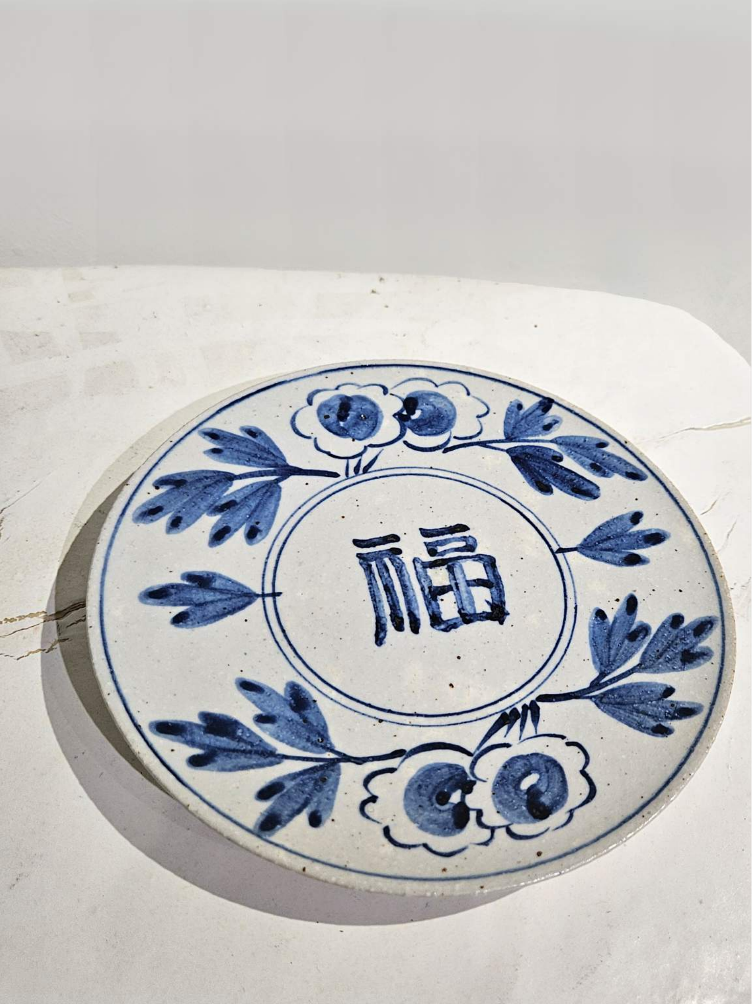
Kim Yikyung, Fu 福 Plate (small) (2023), porcelain, mixed clay, glazed and hand painted, 20 cm diameter (YK182)