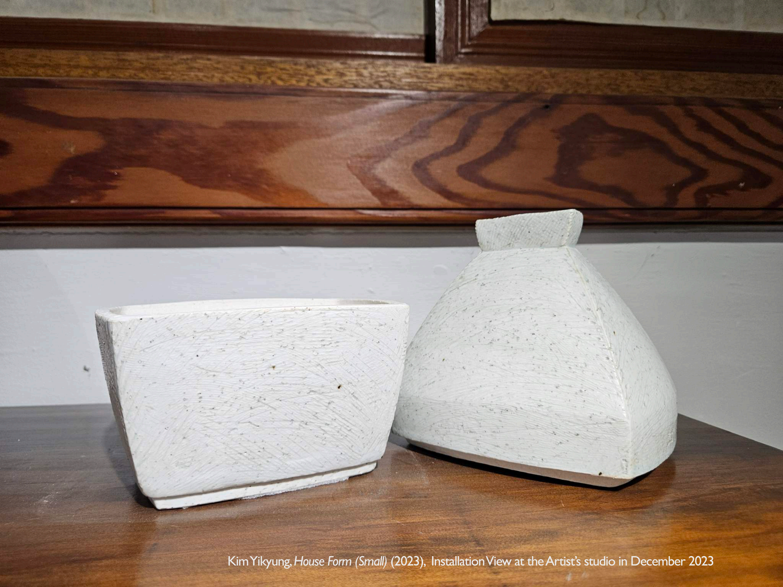
Kim Yikyung, House Form (Small) (2023), Installation View at the Artist's studio in December 2023