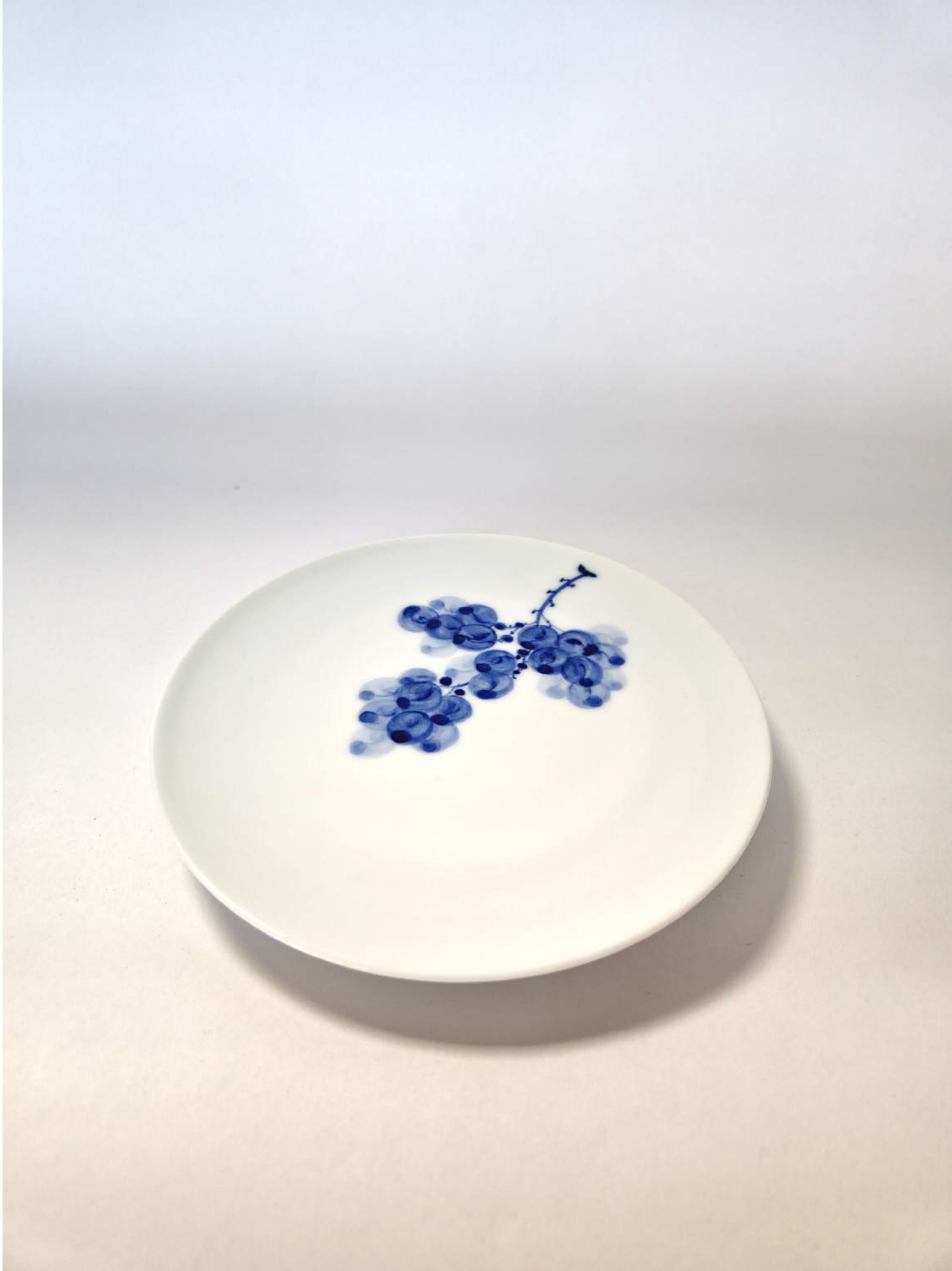
Kim Yikyung Plate with Grapes (2023), porcelain, glazed and hand painted, 16.5 cm diameter (YKI79)