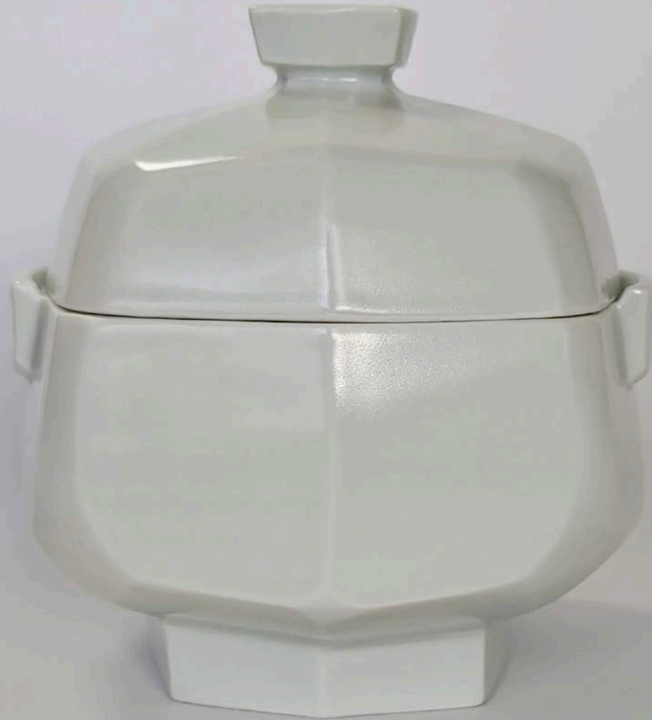
Kim Yikyung Lidded Form (White) , 2023, porcelain, glazed, 12.5 x 13 x 12.5 cm (YK161)