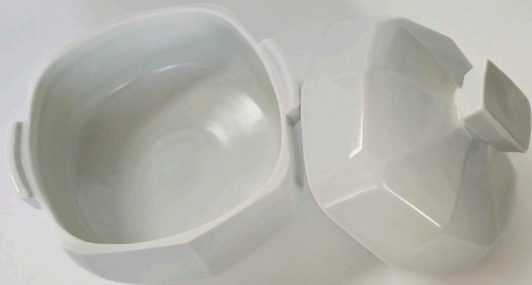
Kim Yikyung Lidded Form (White) , 2023, porcelain, glazed, 12.5 x 13 x 12.5 cm (YKI161)