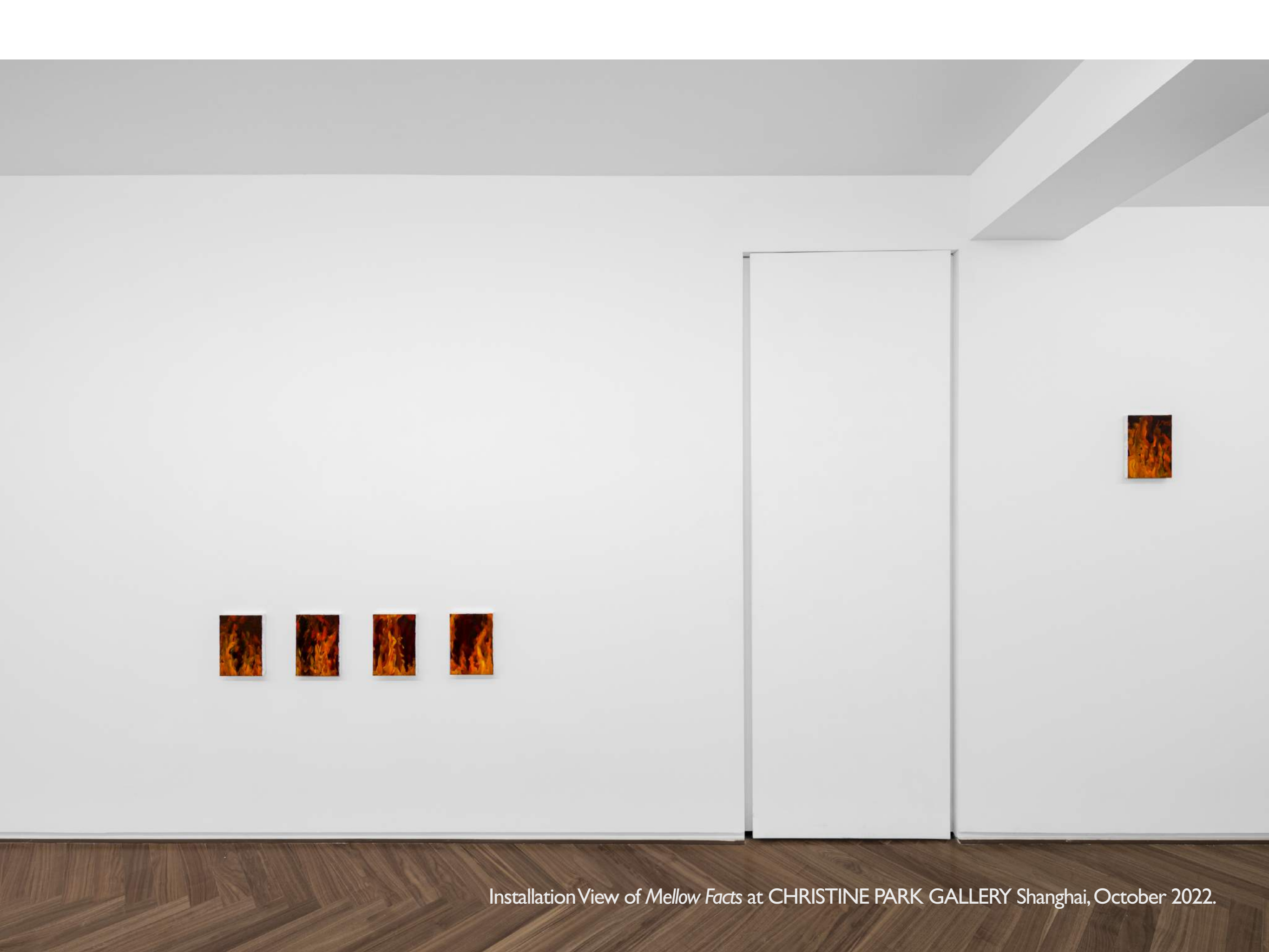
Installation View of Mellow Facts at CHRISTINE PARK GALLERY Shanghai, October 2022.