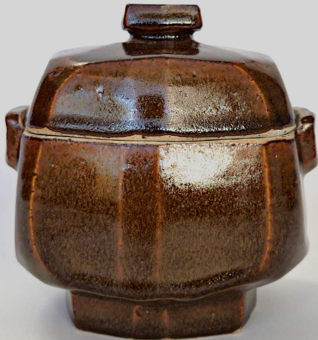
Kim Yikyung Lidded Form (Brown) , (2023), porcelain, glazed, wood firing, 12 x 13 x 11 cm (YK160)