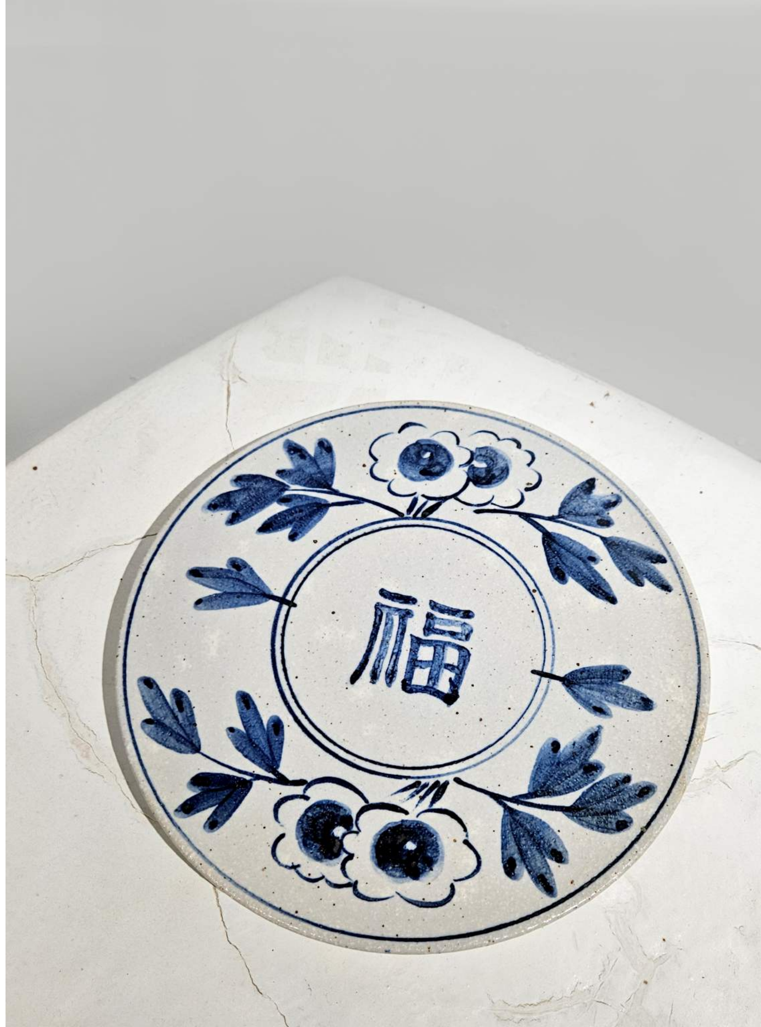
Kim Yikyung, Fu 福 Plate (Large) (2023), porcelain, mixed clay, glazed and hand painted, 27.5 cm diameter (YK184)