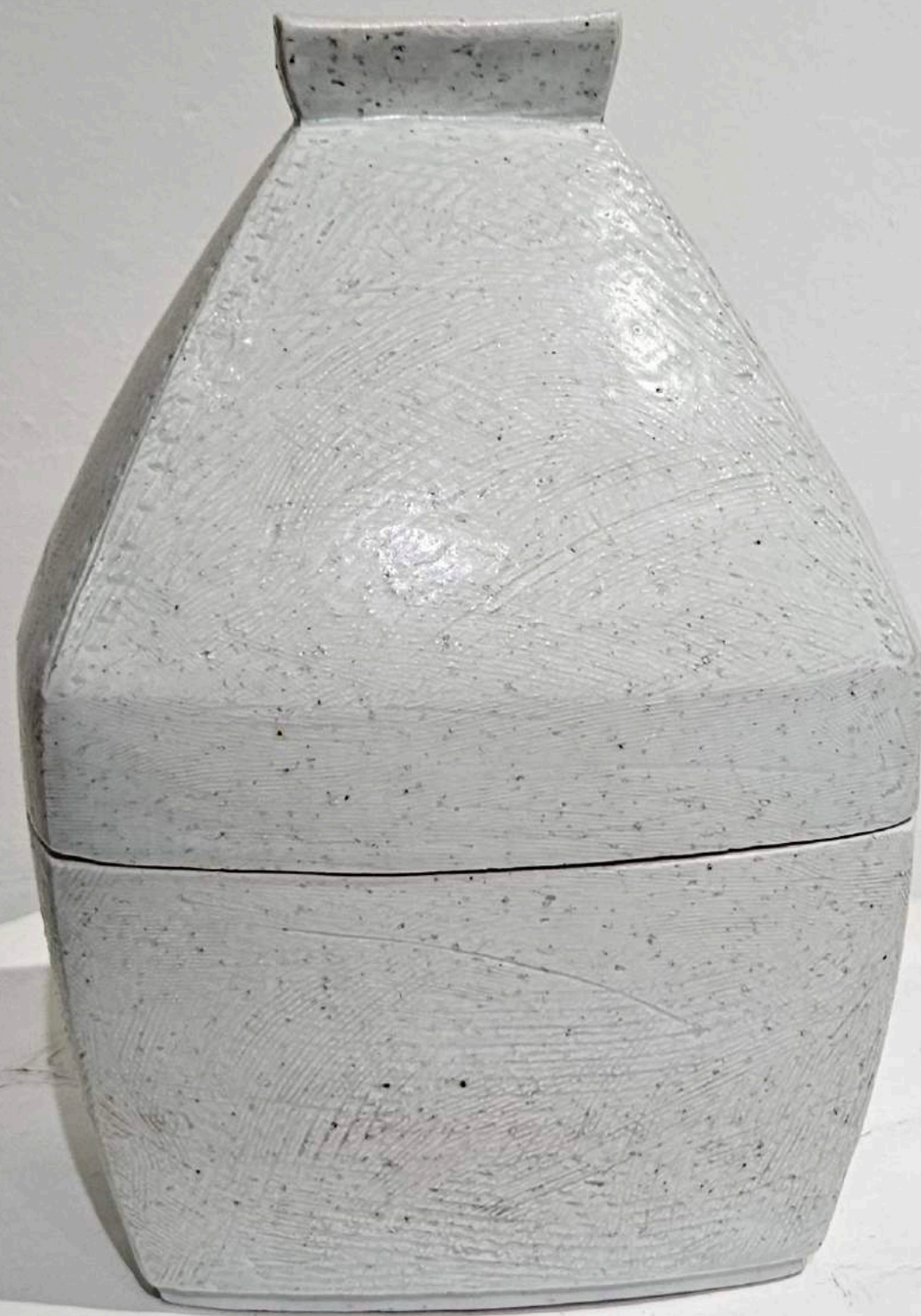
Kim Yikyung, House Form (Medium) (2023), porcelain, glazed, 26 x 19 x 16 cm (YK165)