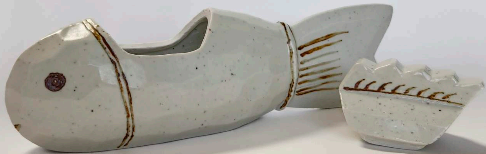
Kim Yikyung, Mini Carp (with Grains) , (2023), porcelain, glazed and hand painted, 9.5 x 28.5 x 7 cm (YKI171)