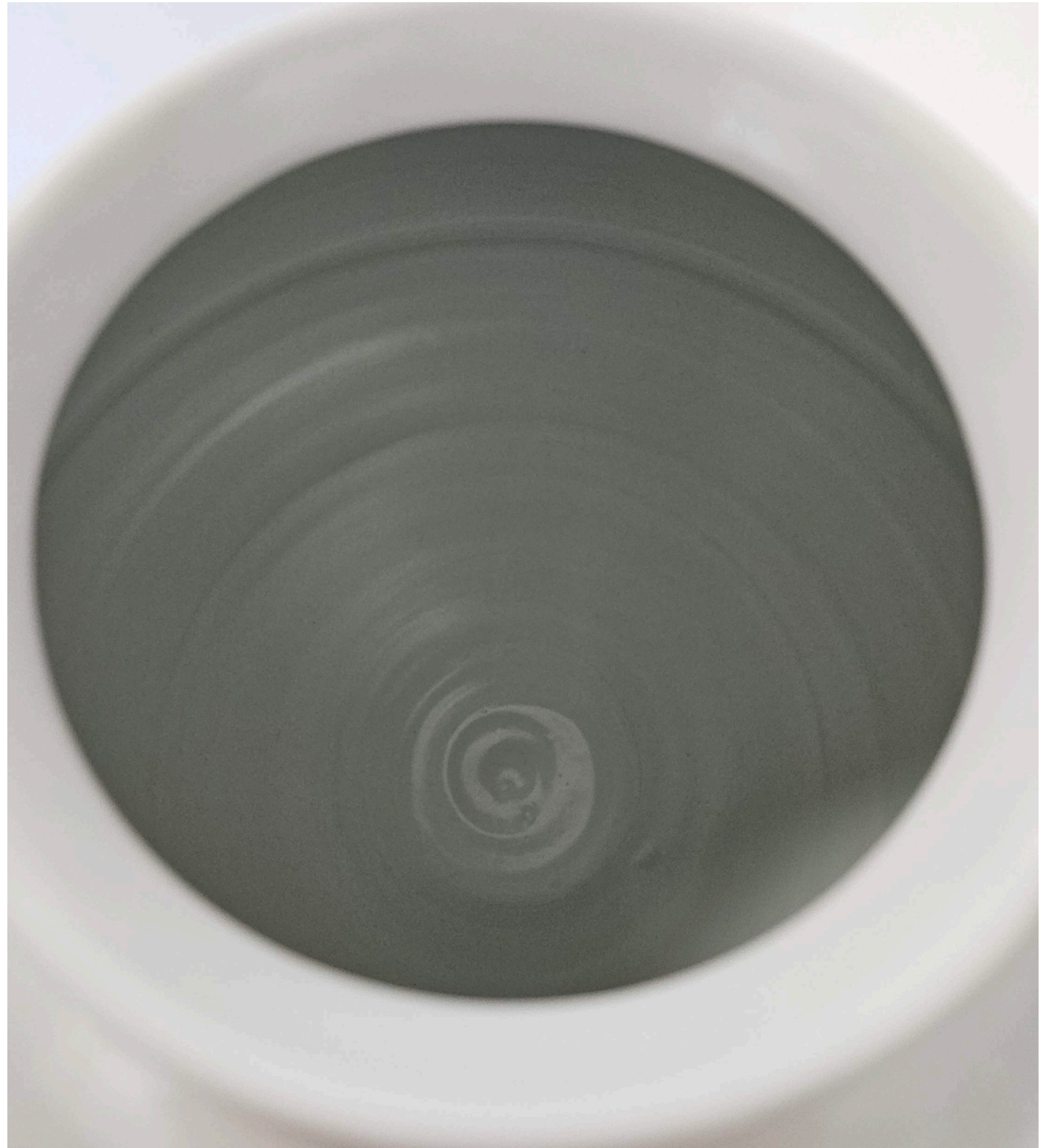
Kim Yikyung Moon Jar (2023), YK157, detail