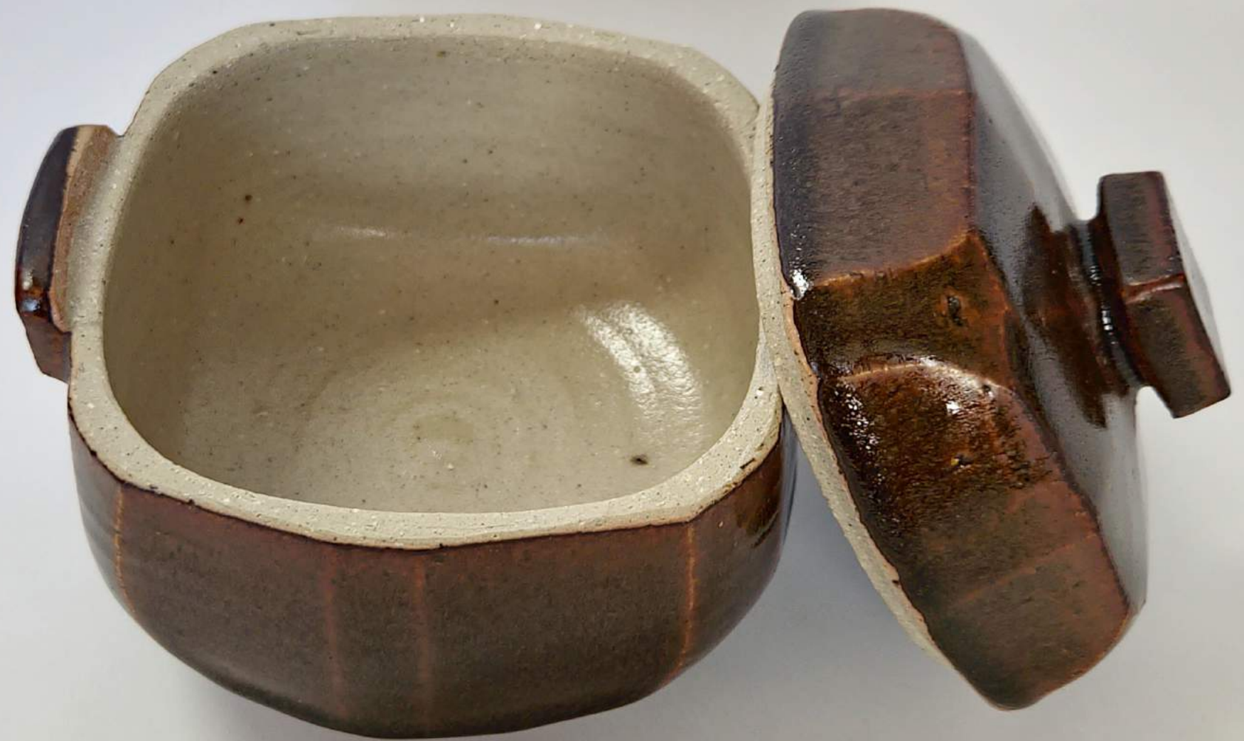
Kim Yikyung Lidded Form (Brown) , (2023), YK160, detail