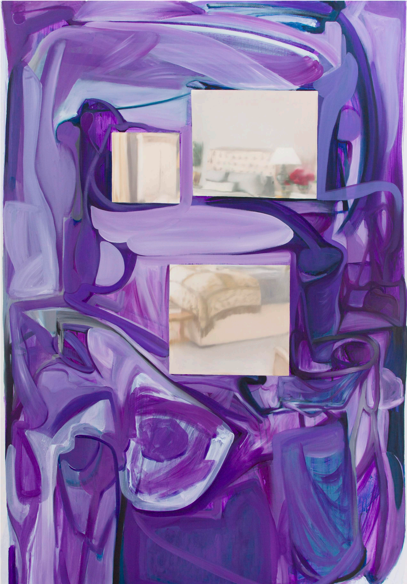
Wei Xiaoguang, Purple Thoughts on Bed (2020), oil on canvas, 182.9 x 121.9 cm (WX001)