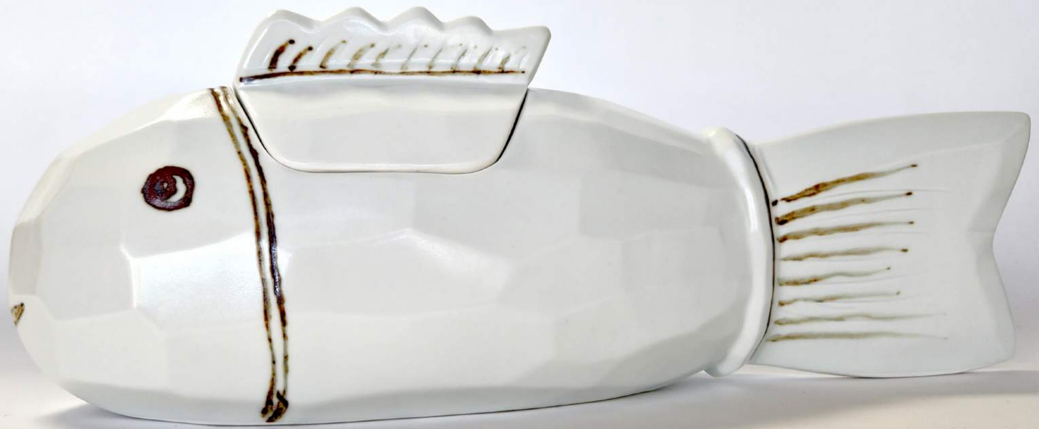
Kim Yikyung, Mini Carp (Plain White) , (2023), porcelain, glazed and hand painted, 11.5 x 31.5 x 7.5 cm (YK172)