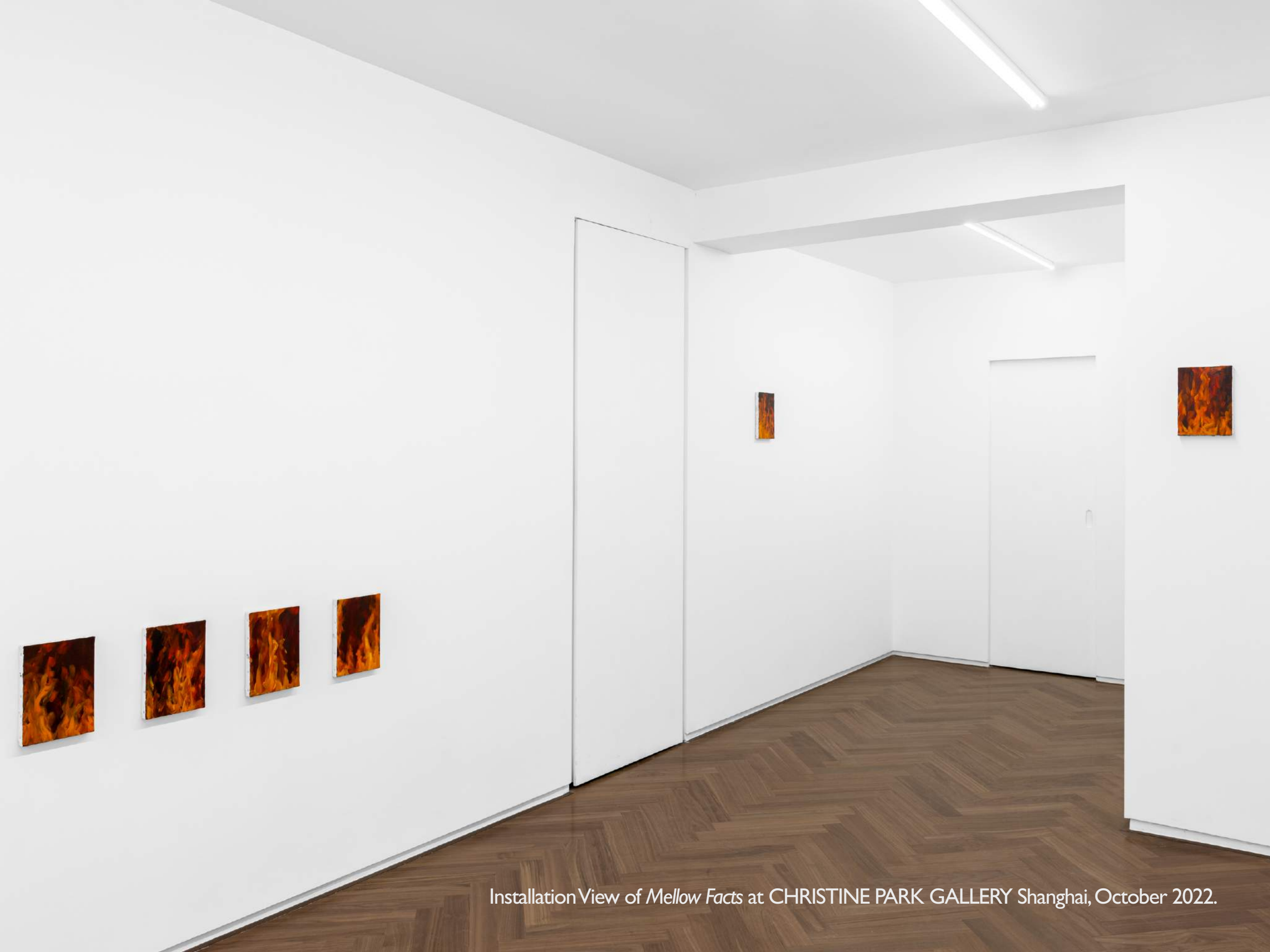
Installation View of Mellow Facts at CHRISTINE PARK GALLERY Shanghai, October 2022.