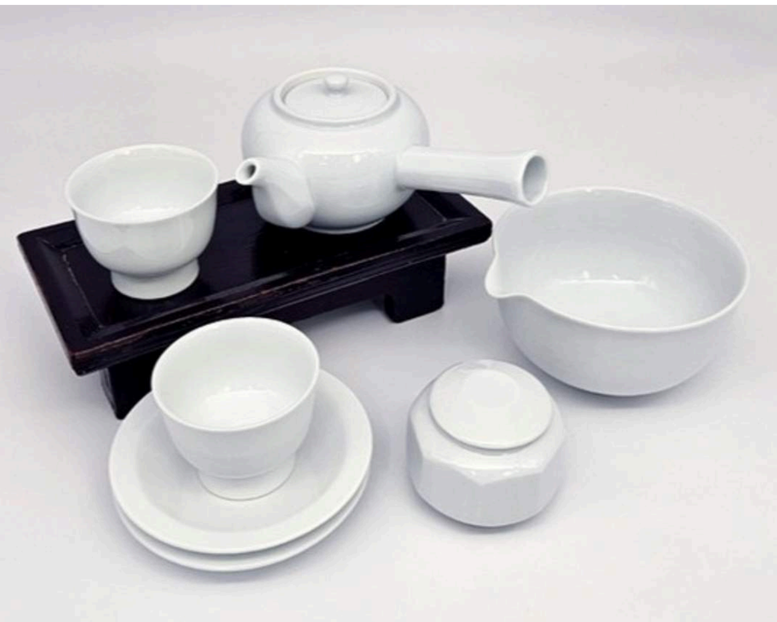
Kim Yikyung, Teaware Set (2023), porcelain, glazed, dimension variable (YK196)