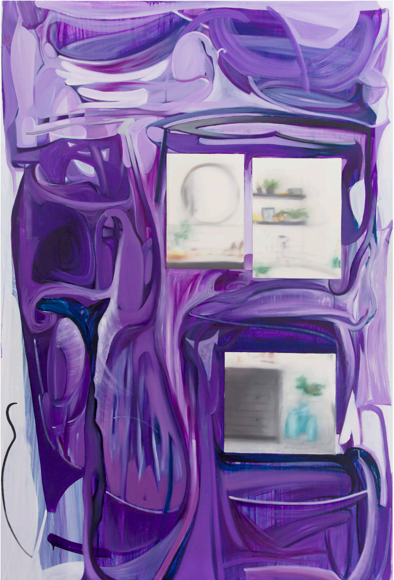
Wei Xiaoguang, Purple Thoughts on Bath (2020), oil on canvas, 182.9 x 121.9 cm (WX011)