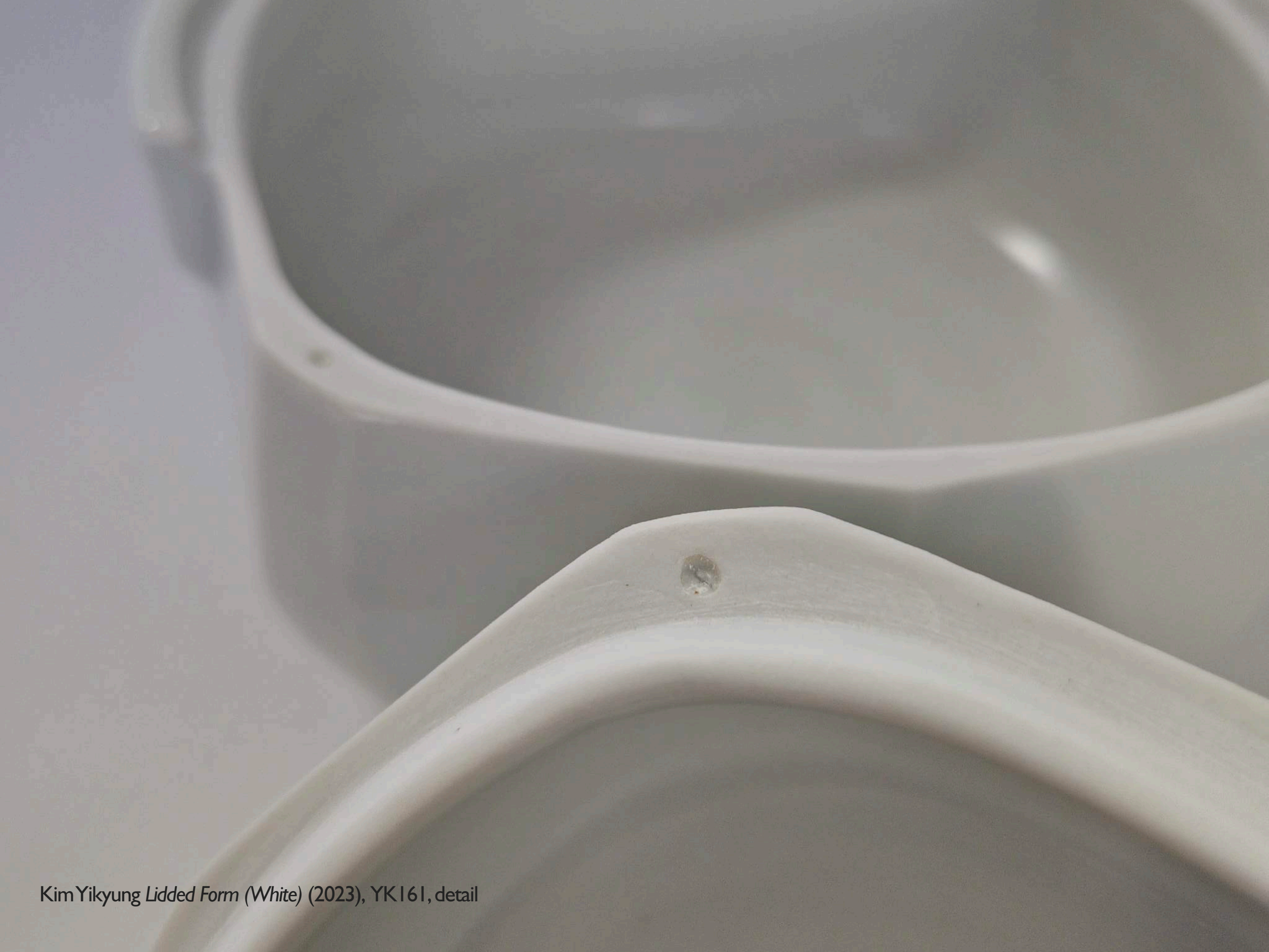
Kim Yikyung Lidded Form (White) (2023), YK161, detail