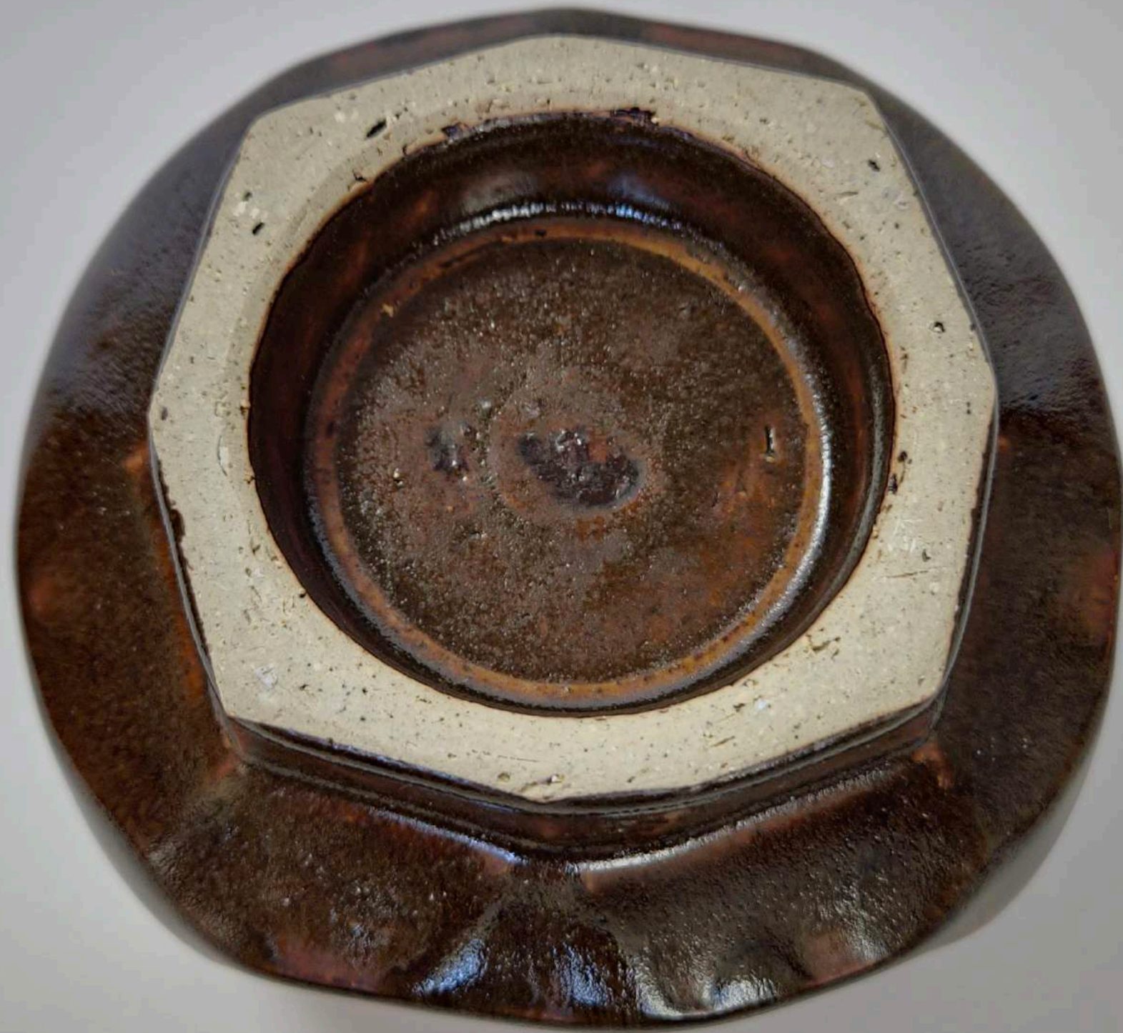
Kim Yikyung Lidded Form (Brown) , (2023), YK160, detail