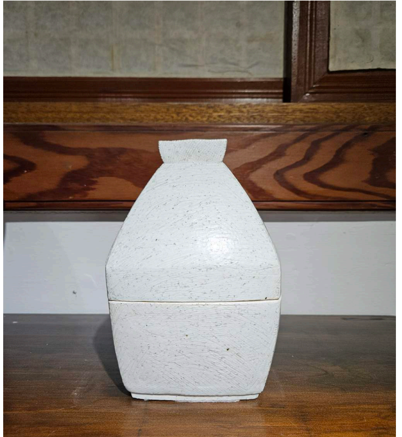
Kim Yikyung, House Form (Small) (2023), YK164