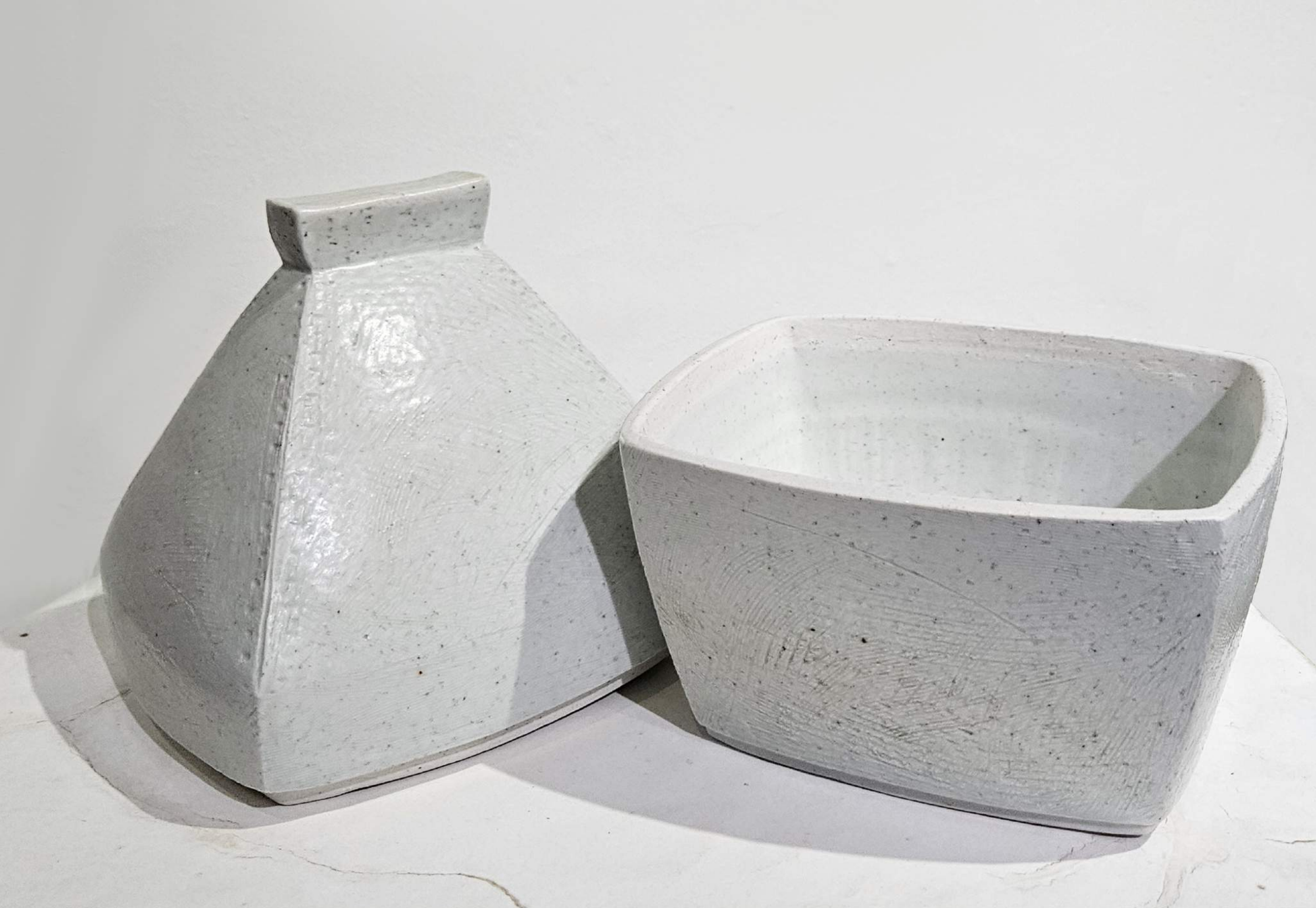
Kim Yikyung, House Form (Medium) (2023), porcelain, glazed, 26 x 19 x 16 cm (YK165)