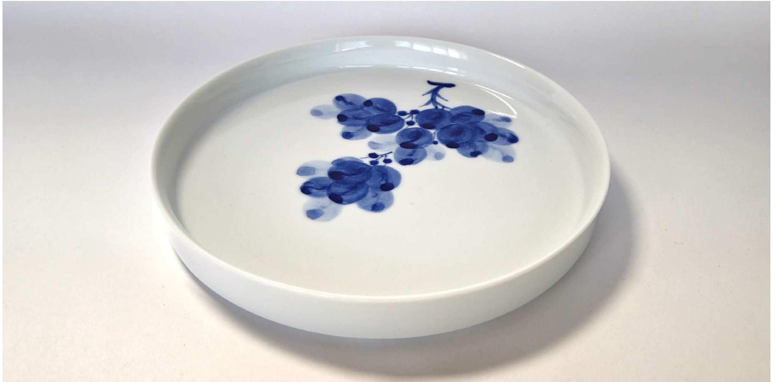
Kim Yikyung Plate with Grapes (2023), porcelain, glazed and hand painted, 19.5 cm diameter (YK180)